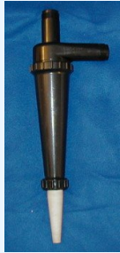
Type 56 Cone

High efficiency hydro-cyclones are the key to removing particulate contaminants down to 5-microns or 0.00019 inches. Encyclon cyclonic cones generate a centrifugal force at 7,500 times gravity so the heavier copper items found in marina waste water are filtered at the most efficient rate.